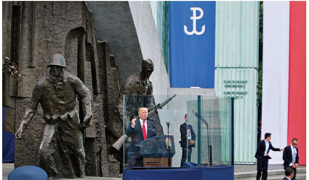
US President Donald J. Trump gives a speech in front of the Warsaw Uprising Monument

Chairman of the PSFCU Supervisory Committee